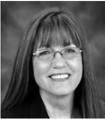
MELINDA BUSH (D) Senator

10 North Lake St., Ste. 112 Grayslake 60030 847-548-5631; 217-782-7353 www.SenatorMelindaBush.com