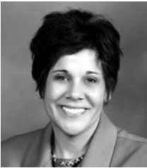
JENNIFER BERTINO-TARRANT (D) Senator

15300 Route 59, Unit 202 Plainfield 60544 815-254-4211; 217-782-0052 www.SenatorBertinoTarrant.com