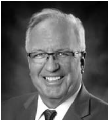
PAT MCGUIRE (D) Senator

2200 Weber Rd. Crest Hill 60403 815-207-4445; 217-782-8800 www.SenatorPatMcGuire.com