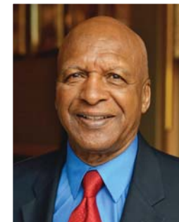
Jesse White Secretary of State